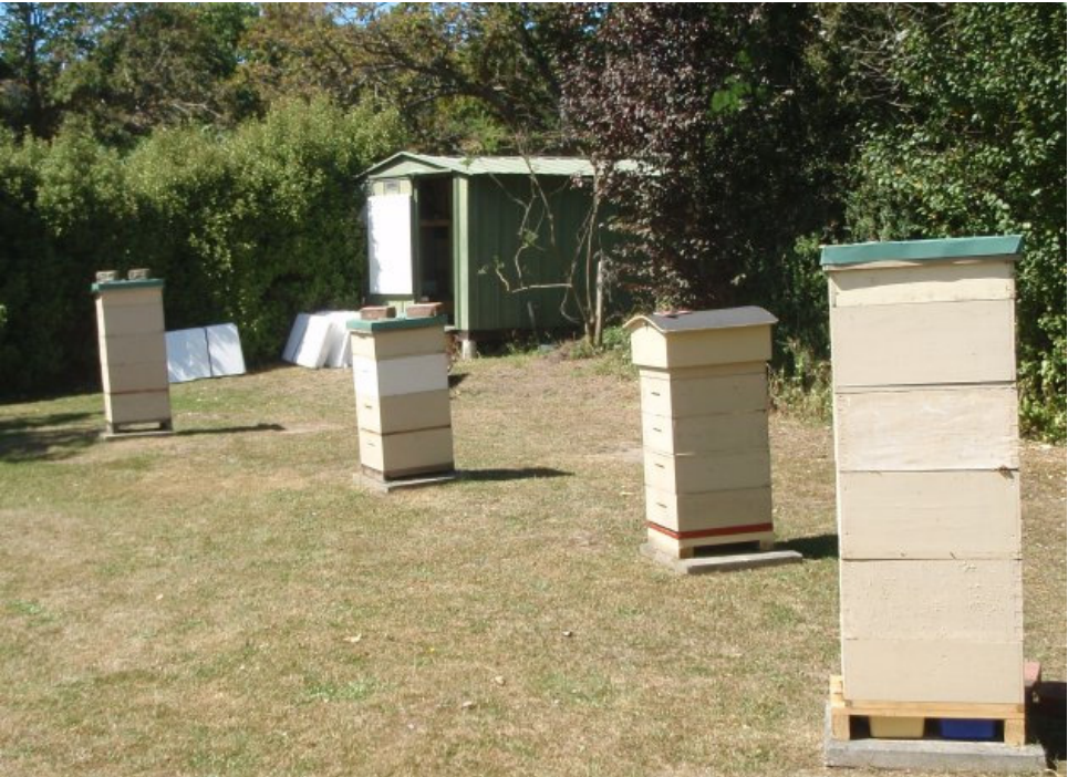
Hobbyist group apiary with the group's storage hut. Double broods on each hive. The hive second right was the "ladies Hive" with a \frac{3}{4} depth brood boxes.