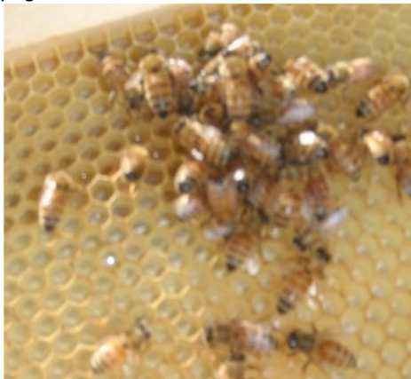
White at 7.30 to clump of bees is larvae on opposite side of frame with varroa seen feeding at the bottom of the cells.