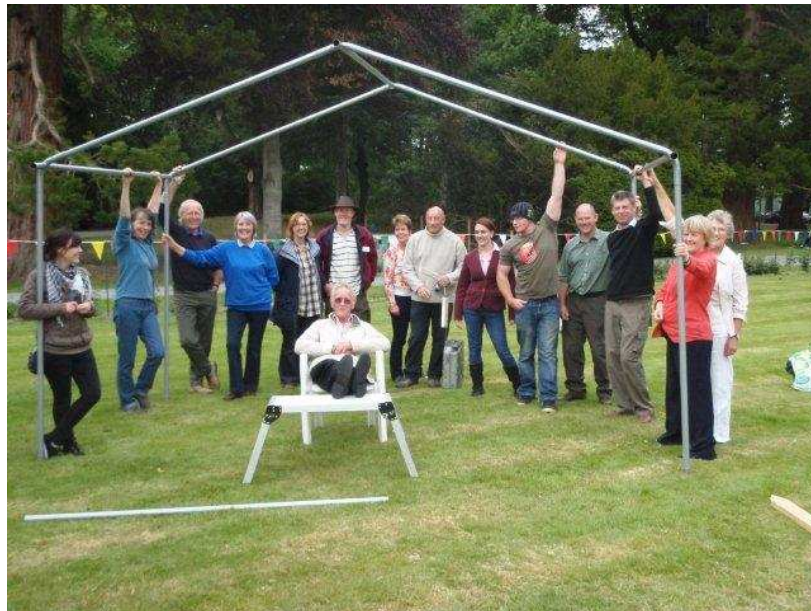
The chairman on his chair.

about their work in Africa. See here for more information about what they do.