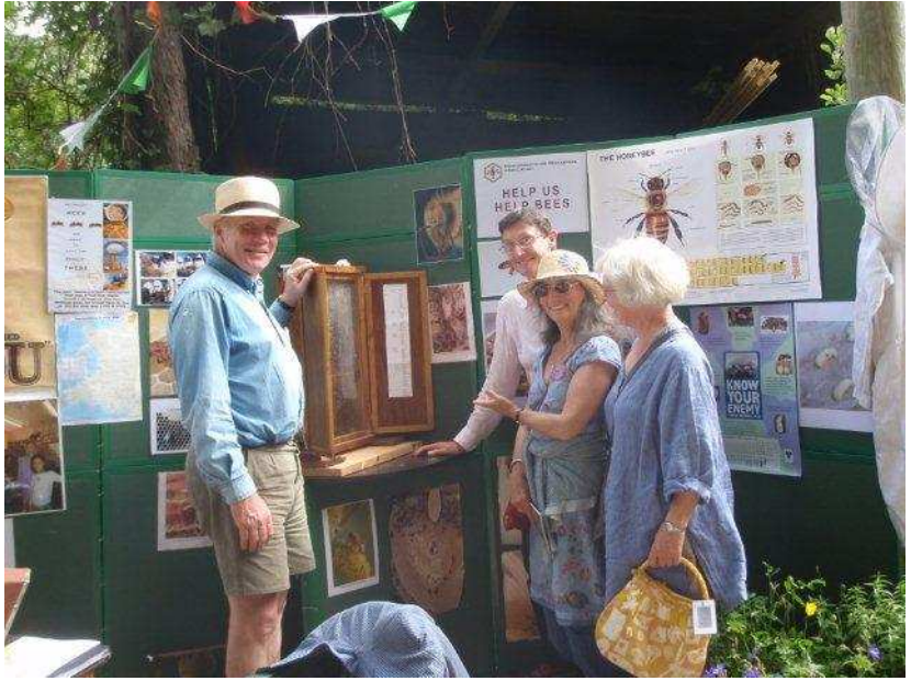
Help us help bees