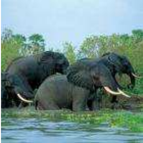
Don't expect this