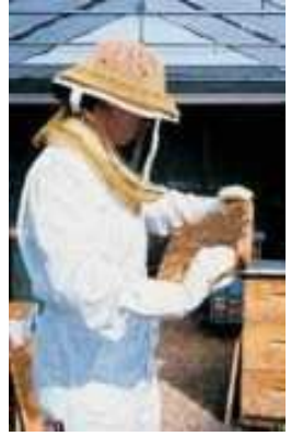
Dress for bee safari