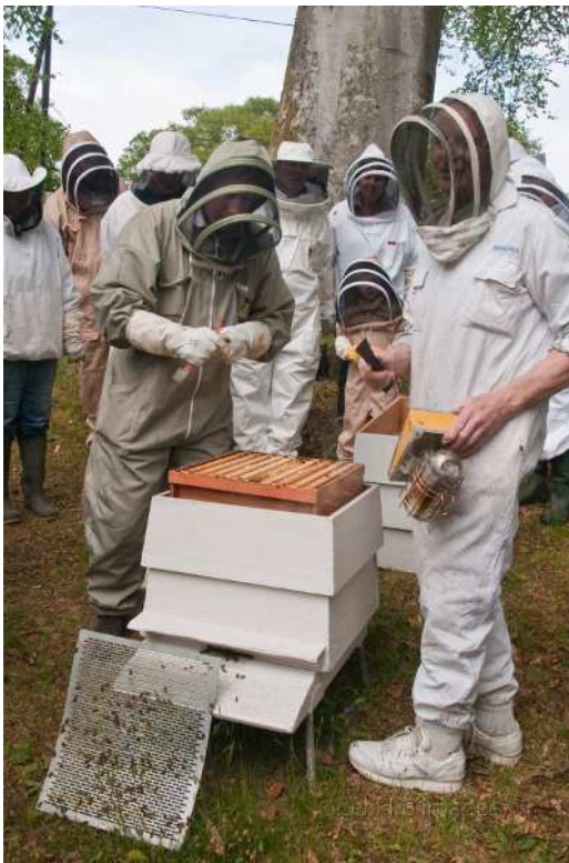
Inspection at Gregynog, reproduced courtesy of Gekko